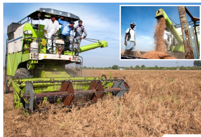
Combine harvester at work – harvesting the new chickpea variety.