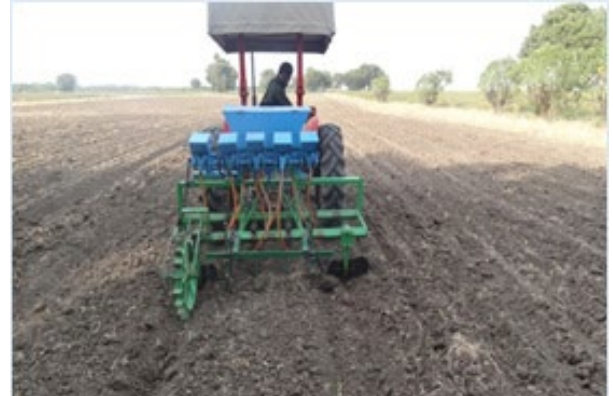
Tractor operated BBF Maker