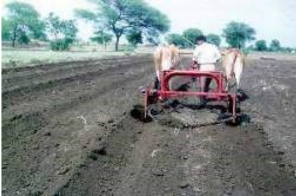
Bullock operated Tropicultor